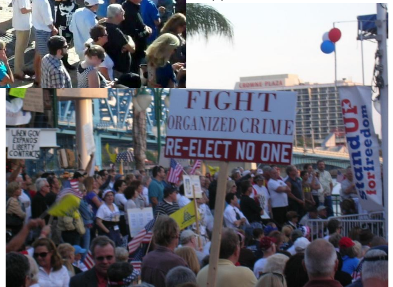
2010